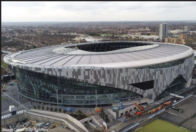
London's New Tottenham Hotspur's Stadium